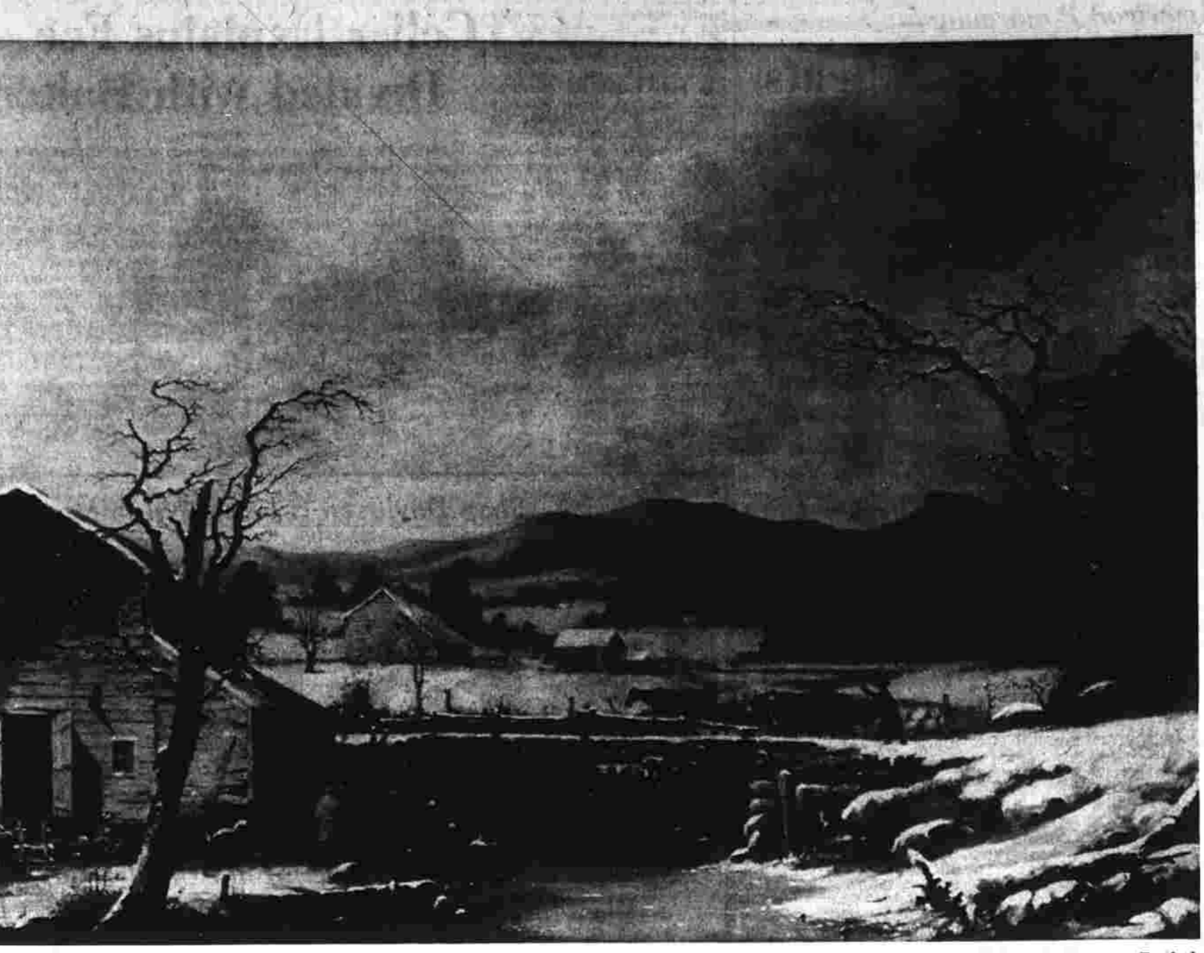
NEW ENGLAND ARTIST'S NEW ENGLAND WINTER

Most of the parents of these kids in trouble who might have visited him and joined in his experiment stayed away. They lack even that much interest in